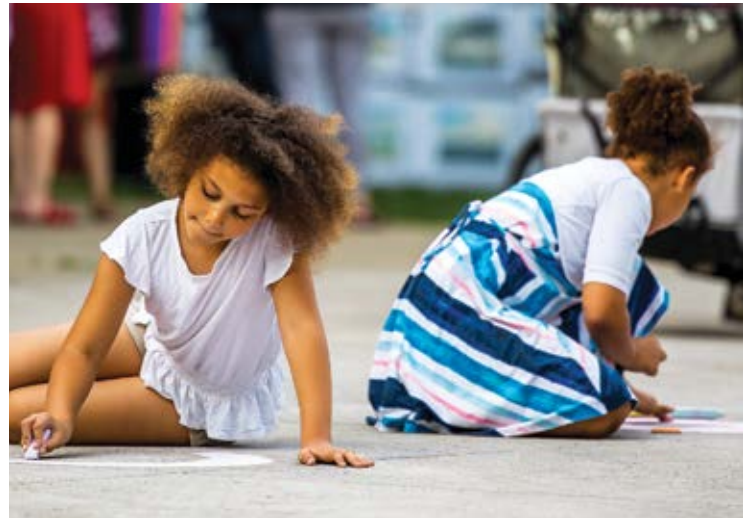
Chalk drawing at the ARTS Fair.

In prizes and college scholarships awarded to students in the High School Area Show