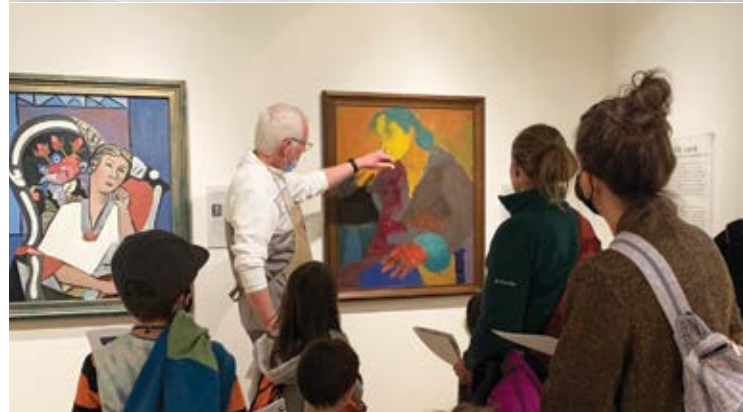
Families enjoying Art Detectives in the permanent collection galleries as they view a painting by Victoria Littna.