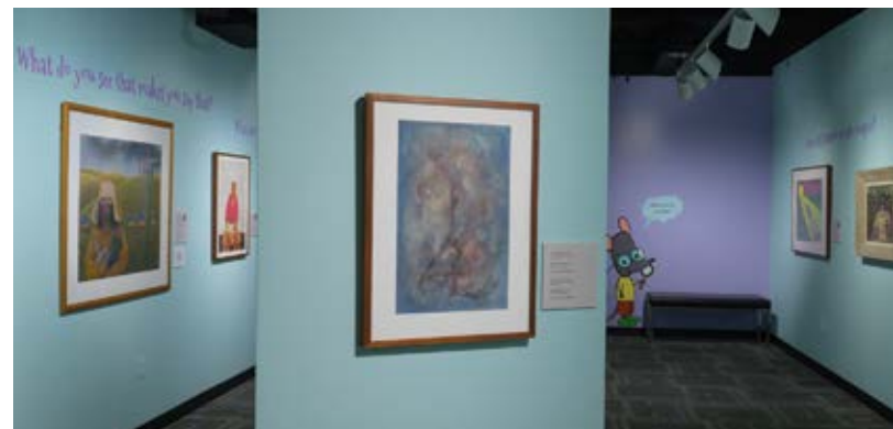
What is Going On in This Picture? installation photo.