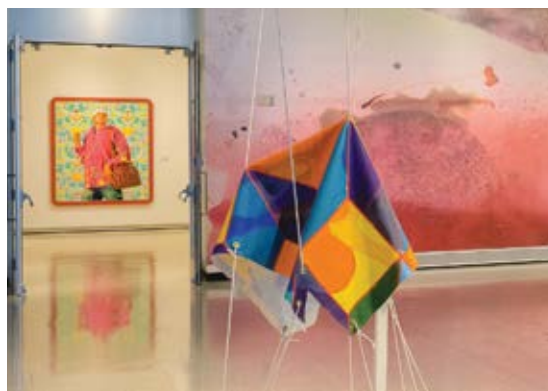
Unmasking Masculinity for the 21st Century installation photo