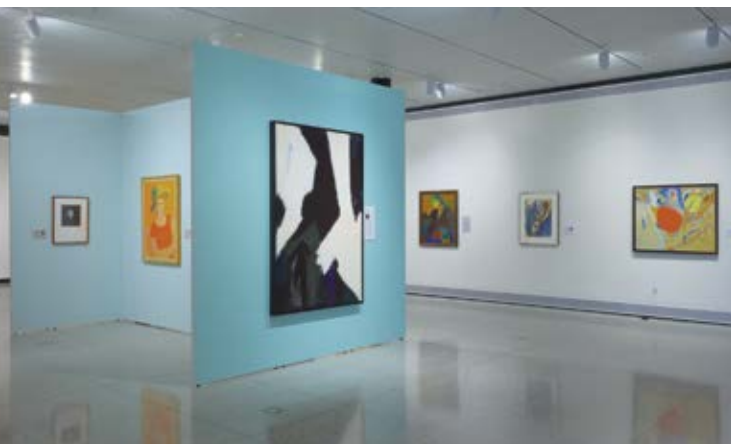
Art, Music & Feminism in the 1950s installation photo.

Expo Chicago 2023 The KIA was invited to participate in the special exhibitions section of this international arts fair, and presented selections from its collection ranging from Chris Ofili to Olga Albizu. April 13 - April 16, 2023