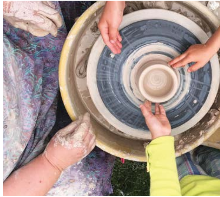
Pictured: KNAS Ceramics Faculty demonstration with children. (above) Welded metal sculpture at the KNAS. (below)