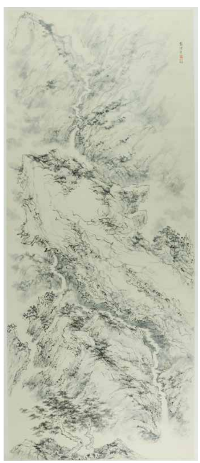
Arnold Chang, Landscape, 2010, ink on paper. Collection of the Kalamazoo Institute of Arts; Joy Light East Asian Art Acquisition and Exhibition Fund, 2017

The expansive vista is a traditional subject with a long history in Chinese painting. Gazing upon a mountainous landscape provided a brief, refreshing escape for the desk-bound Confucian bureaucrat with time for only an imaginary journey.